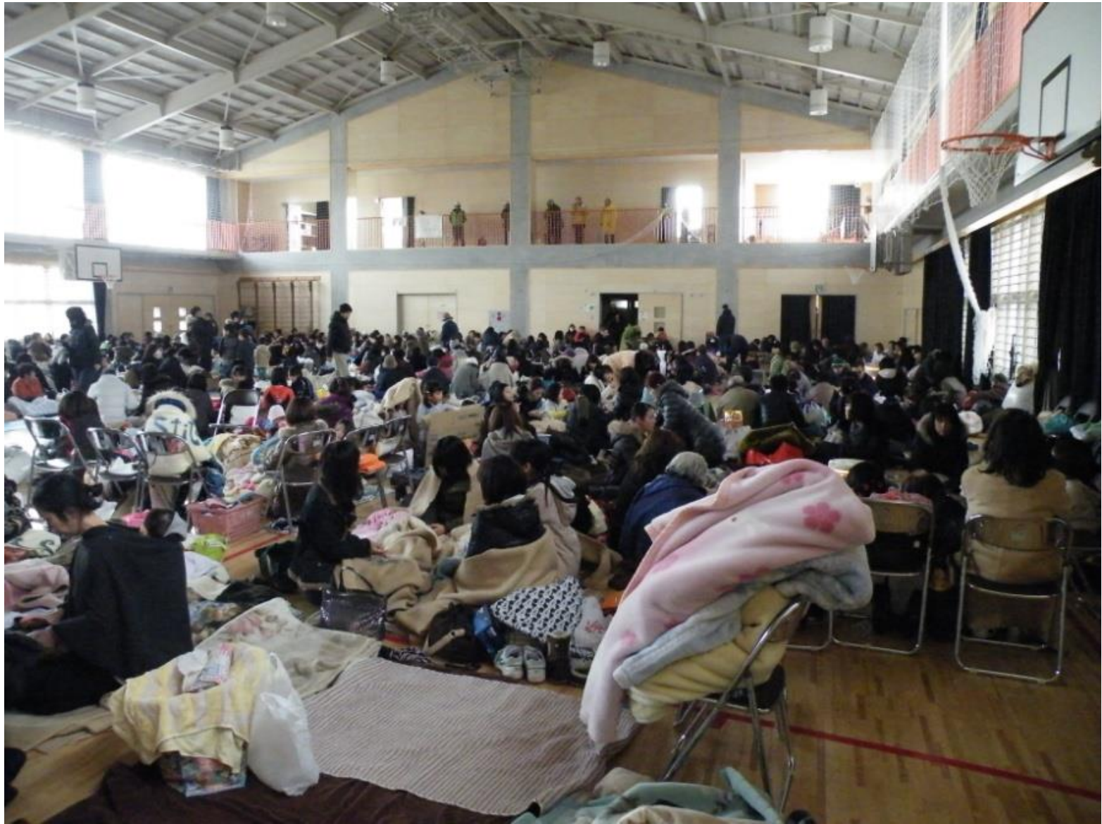
At an evacuation center on the morning of March 12, 2011