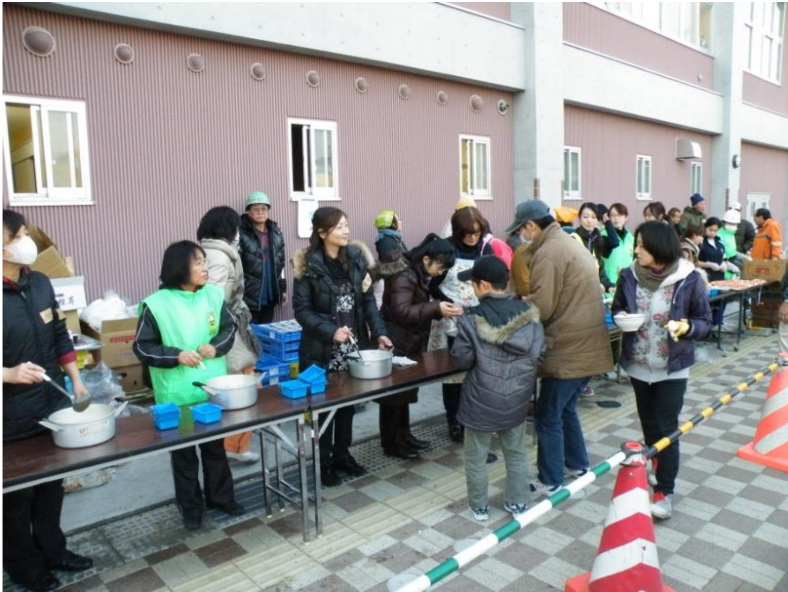
Meals (breakfast) rationed on the morning of March 14, 2011