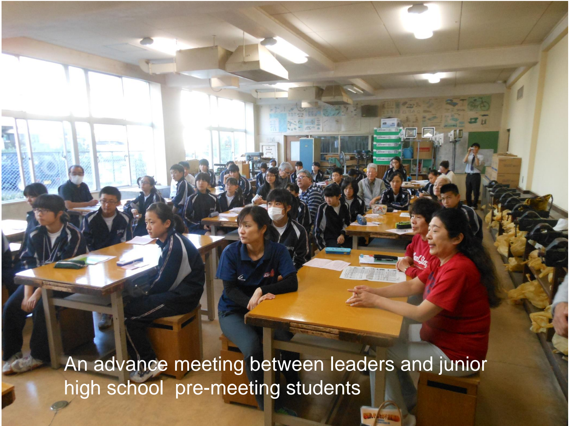
An advance meeting between leaders and junior high school pre-meeting students