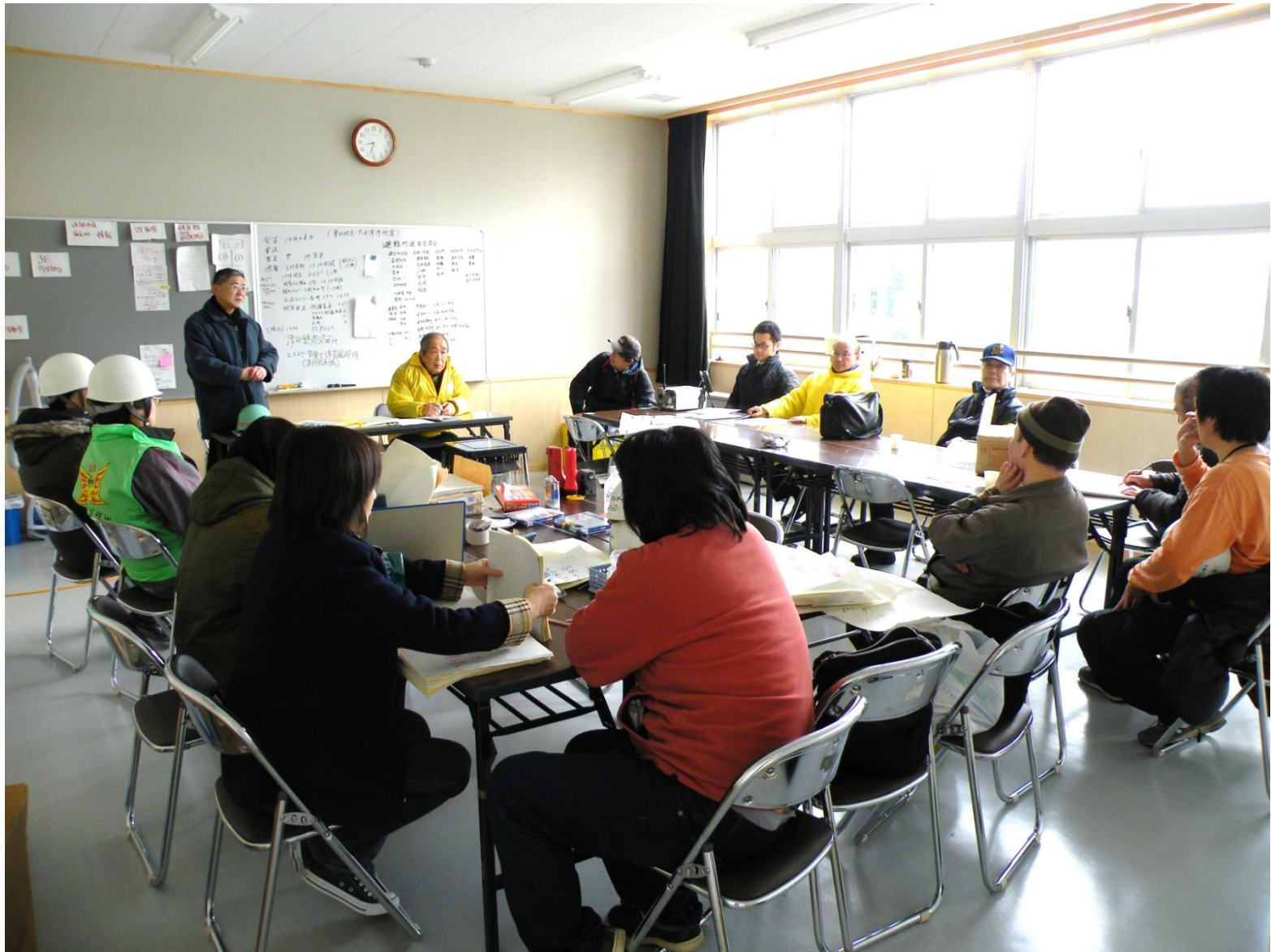
A meeting held on March 12, 2011 by the Managing Committee for the Evacuation Center