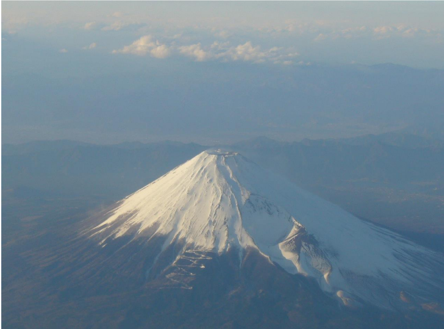
Mt. Fuji, Japan