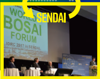
World Bosai Forum was announced at IDRC 2016 in Davos

WORLD BOSAI FORUM / IDRC 2017 in SENDAI November 25 sat ▶ 28 tue, 2017