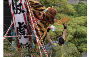
■ Tiger dance from Kesenuma, Miyagi

(For inquiries, please contact IRIDeS PR office, Tohoku University, +81-22-752-2049)