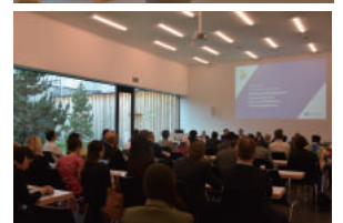
■ IDRC 2016 in Davos