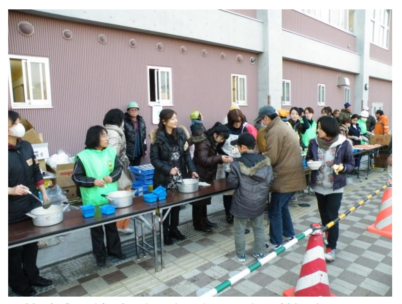
Meals (breakfast) rationed on the morning of March 14, 2011