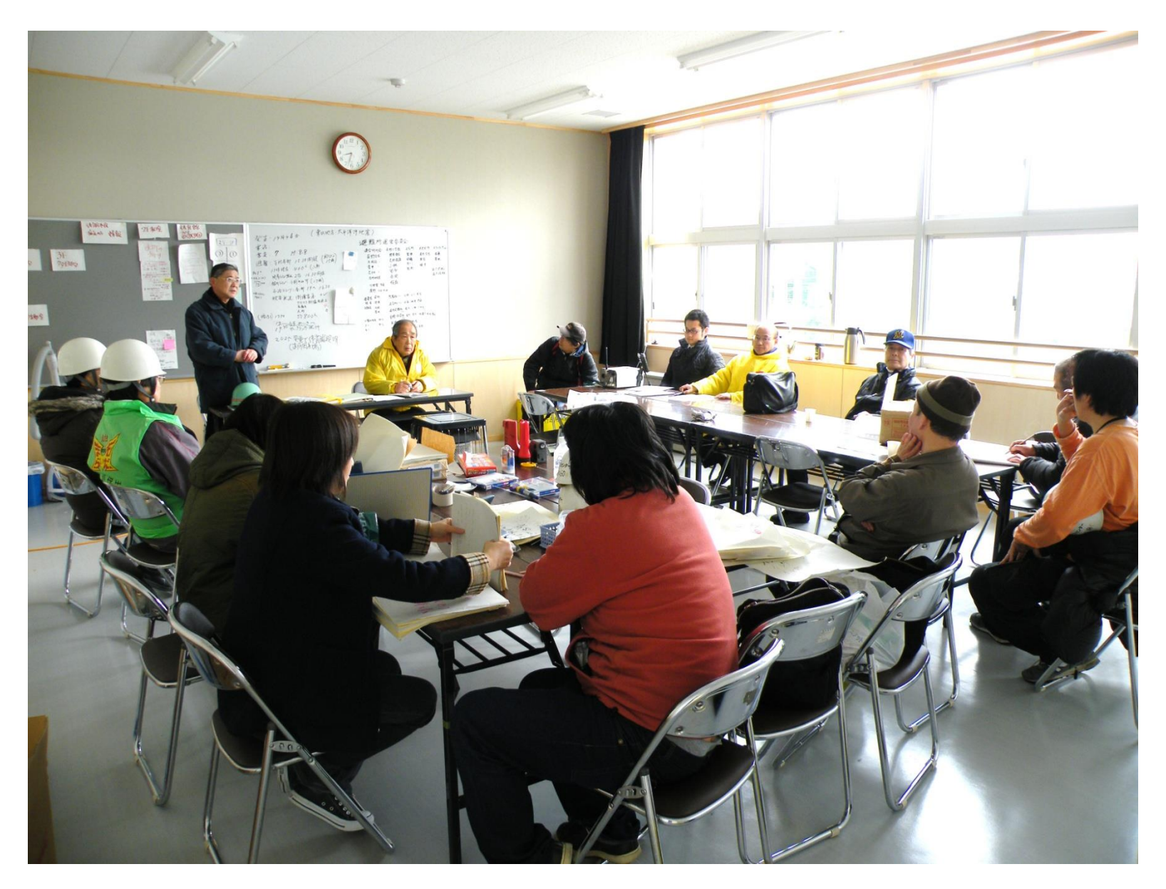
A meeting held on March 12, 2011 by the Managing Committee for the Evacuation Center