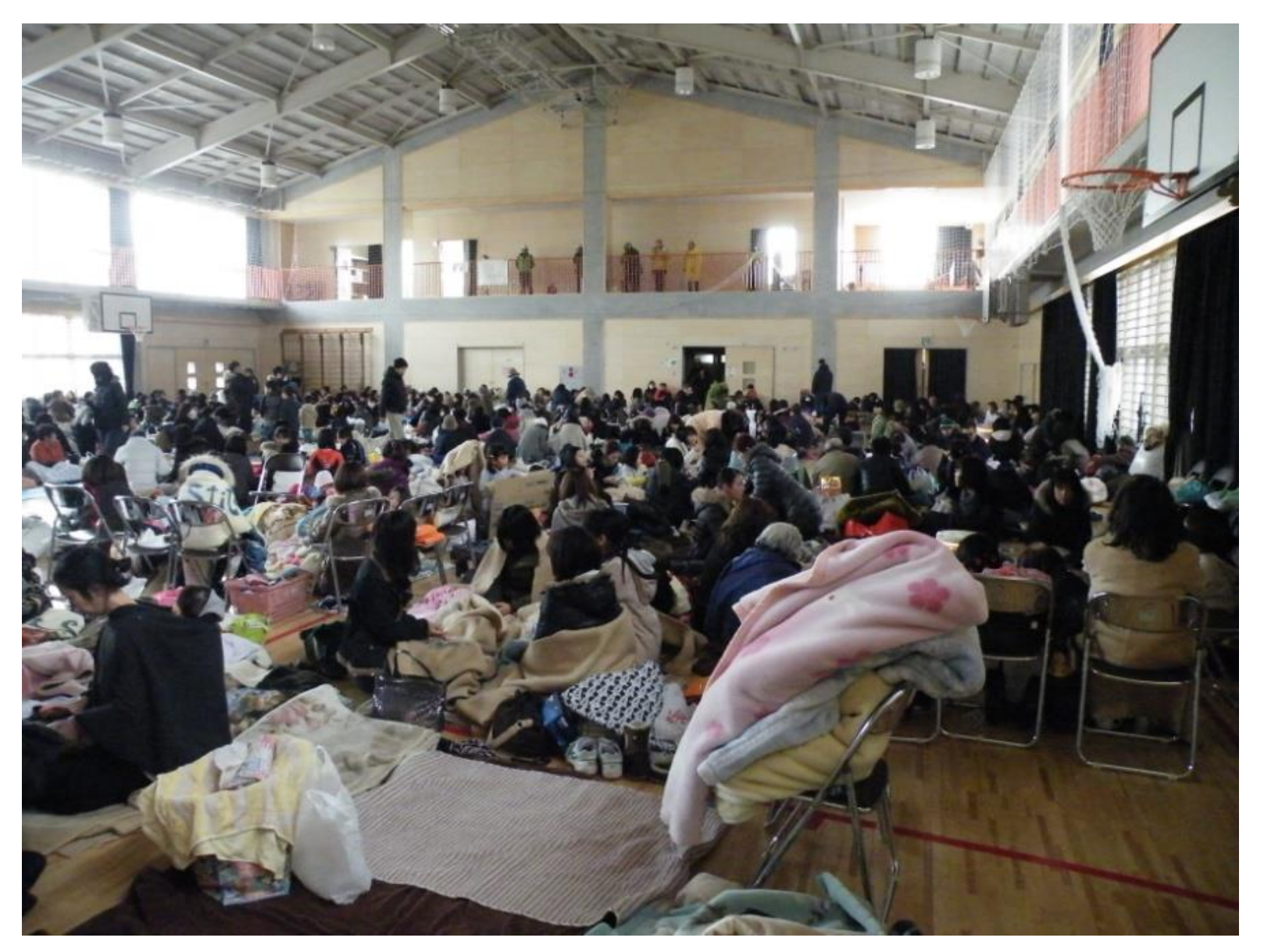
At an evacuation center on the morning of March 12, 2011